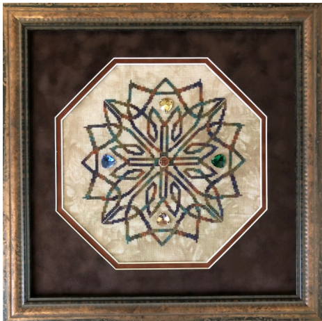
"Oaken" from Stitches' Village Designs stitch count 120 x 120

Not everything here will be brand new, sometimes I find something I have not seen before. . .