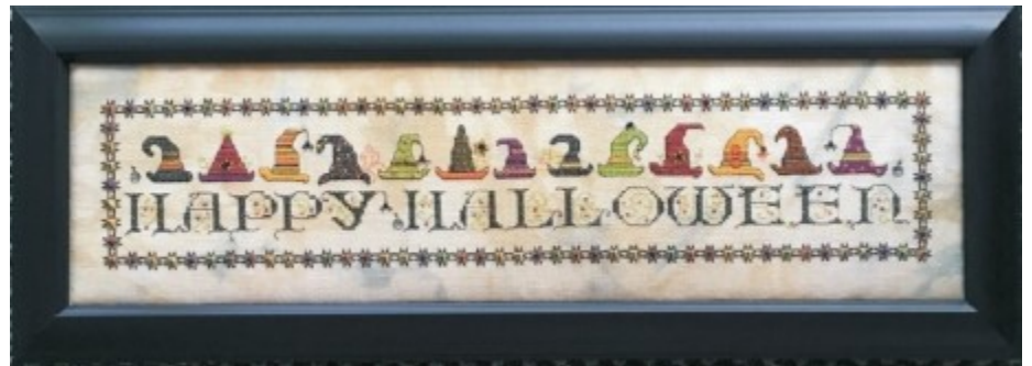
"Happy Halloween" from Rosewood Manor stitch count 258 x 54