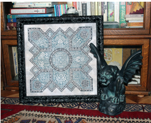
"Castle Walls" from Ink Circles stitch count 235 x 235

As always, if you stash any of these items, please say you saw it on The Stitches' Village!!