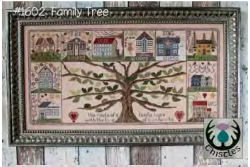
Above are "I Remember" (4th in the Village Home Series) and "Family Tree" Below are "Circle of Sheep" and "Primitive Village"