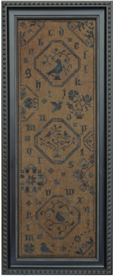
“Quaker Bluebird Sampler”