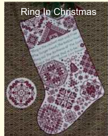
Ring In Christmas

Rosewood Manor designs are available for purchase from the Village shoppes.