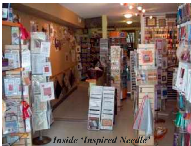
Inside 'Inspired Needle'