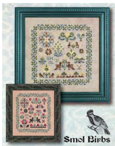
"Smol Birds" And "Elemental Dragons" From Ink Circles