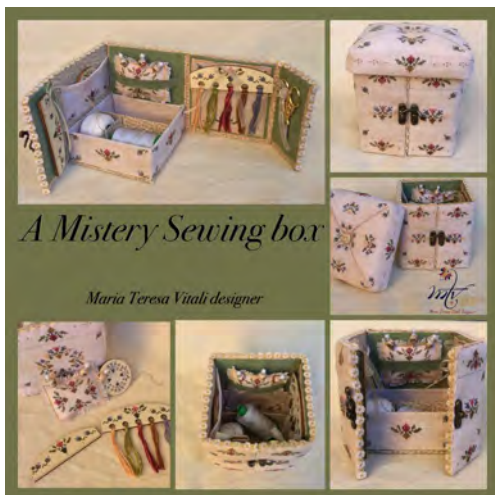
"Mystery Sewing Box" from MTV Designs "Everybody's Uncle" from Fern Ridge Collection