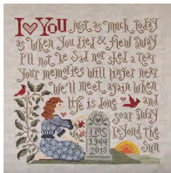
With Thy Needle & Thread: "When Flowers Blossom" (right)