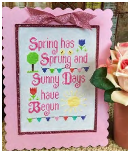
“Farm to Table” and “Spring has Sprung” From Pickle Barrel Designs