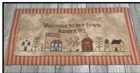
“My Town” and “Hopes and Dreams” From Needle Bling Designs