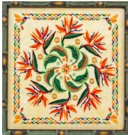
“Strelitzia” and “Phantom Plantation” From Glendon Place