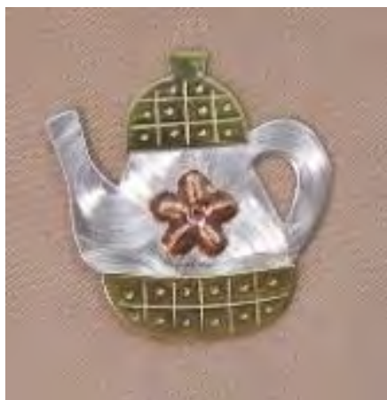
“Little Tea Pot” and “Bee Keep” From Puffin and Company