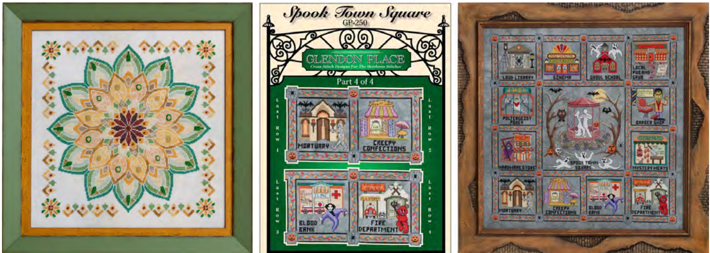
Above left to right: "Helianthus" (The Sunflower Mandala stitch count 198x198); "Spook Town Square - Part 4 of 4"; the full picture of "Spook Town Square" all from Glendon Place

Not everything here will be brand new, sometimes I find something I have not seen before. . .