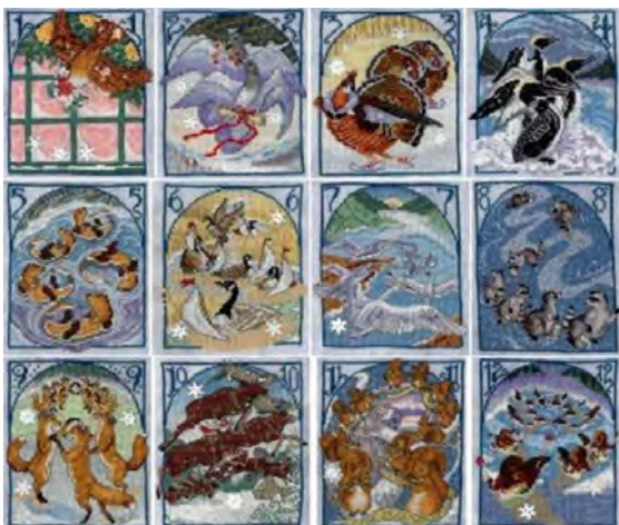
Below: "12 Northern Days of Christmas from X's and Oh's"; "Ye Old Crow Sampler" from Heart in Hand; "Bluebird Garden" from Artful Offerings