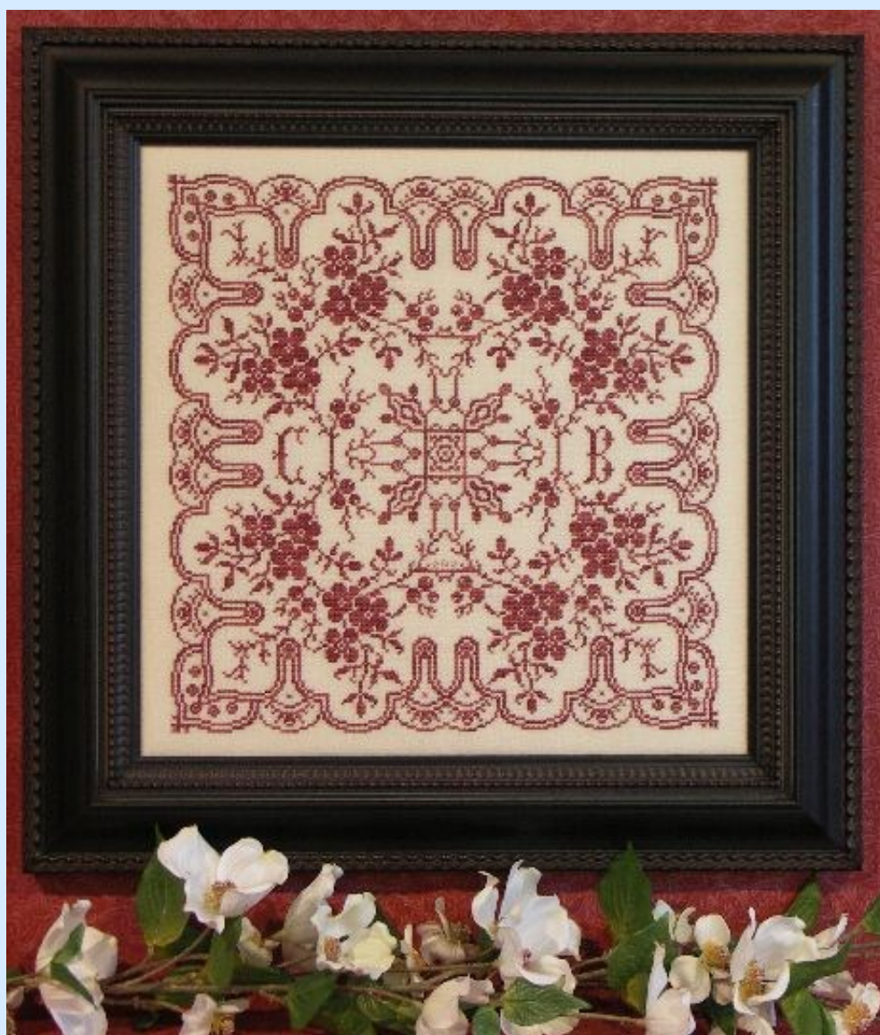
“Dogwood Lace” from Rosewood Manor