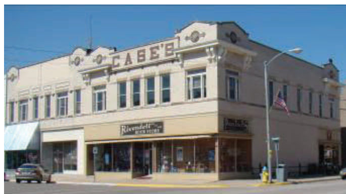
Built in 1901, this building in downtown Abilene, KS now houses the needle art shop Picture This Plus

If you have an opportunity to visit Picture This Plus, you will find a cozy shop with much to browse through and an area to sit, relax, stitch, share your projects, and gather materials for new ones. They carry lots of fibers and accessories. There are many stitched models to view and charts from which to choose. They work to keep a variety of current new designs as well as some old favorites, and proudly promote the unique and hard-to-find designs. There are many items to choose in house, and are happy to order whatever you may be seeking for your projects. The special feature of their shop is that, in the next room, the dyeing of the Colorscapes line of hand-dyed fabric takes place. So, you can put together a one of a kind masterpiece stitching project!