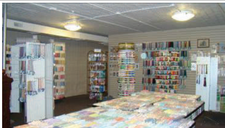
Fibers and fabrics are on display in Picture This Plus

Picture This Plus is now in a building that was built in 1901 as a department store and continued as such until 1990. At that time it became a textile museum which was there until PTP purchased the building. It is a wonderful shop to visit with either your fellow stitching companions or the whole family. Along with your stop at Picture This Plus, Abilene offers a wide variety of must-see sites including the Dwight D. Eisenhower Center, Historic Old Abilene Town, The Seelye and Lebold Mansions, and the Greyhound Hall of Fame. There are many one-of-a-kind dining places including the coffee shop located upstairs in the book store, the historic Kirby House Restaurant, and the Brookville Hotel which serves a family style chicken dinner.