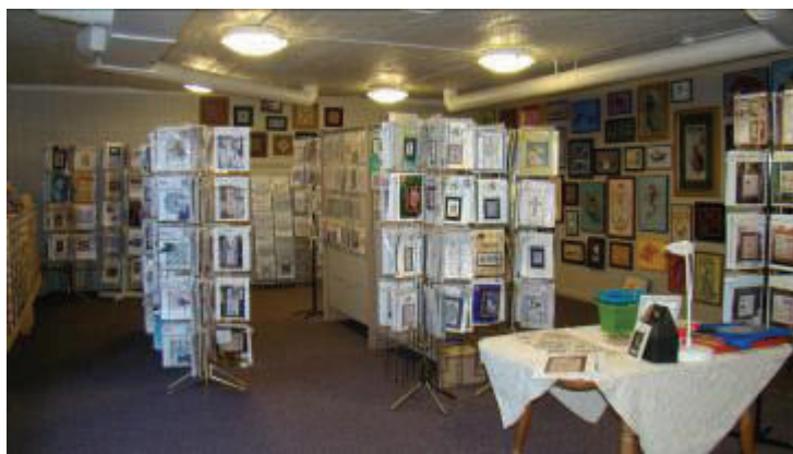
There are lots of things to see and a cozy area to sit, stitch, and visit