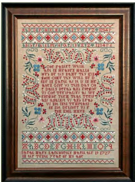
Bottom right: Mill Hill Kits newest releases